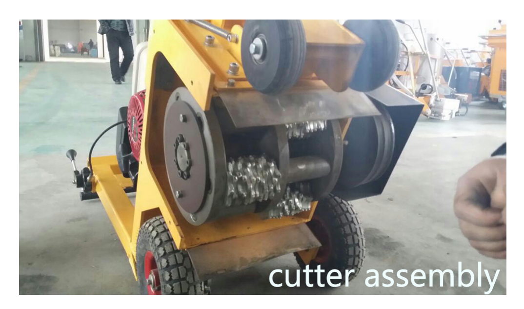
D-390 road removal machine in different angles: