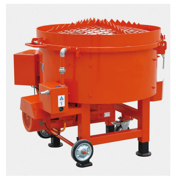
GRM100 & GRM250 Model

Gaode Equipment Co., Ltd. Refractory Gunning Machine.