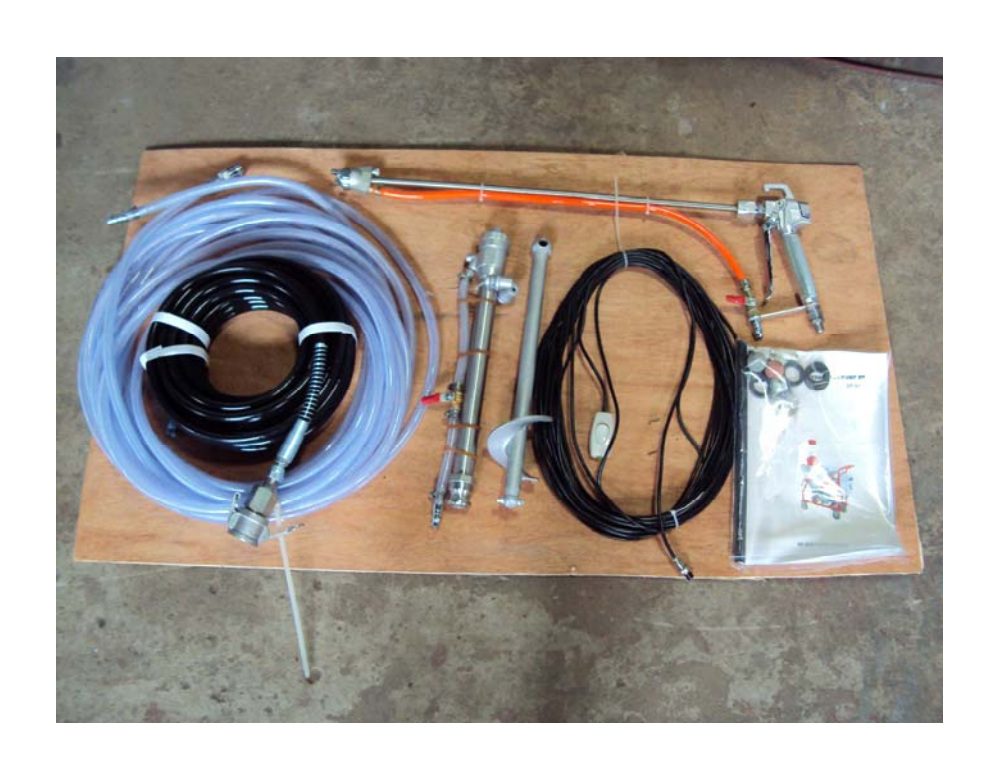
Version: Oct.2012 Copyright@Gaode Equipment Co., Ltd.