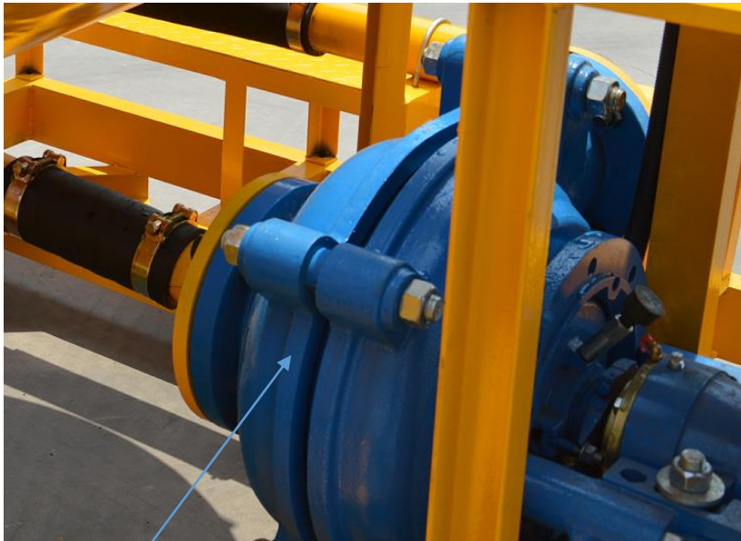
Heavy-duty Slurry pump for recirculating and discharging