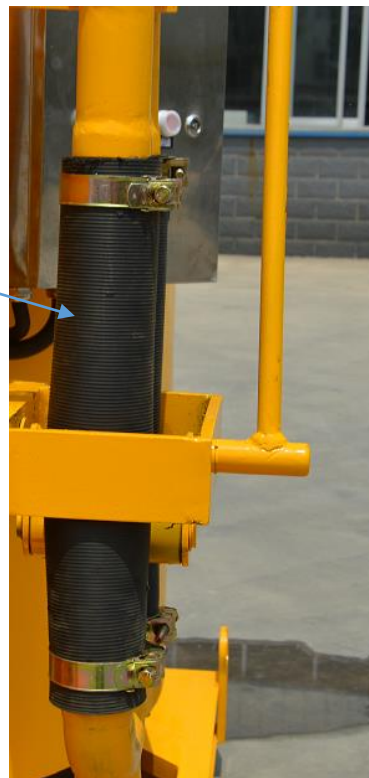
Special Design and Machining Squeeze Hose Valves with million times squeezing work life