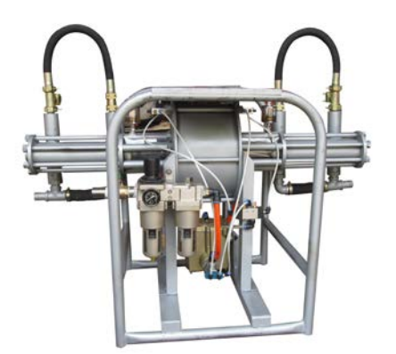
2GP SERIES, the compressed air consumption 1.5m3/min,3m3/min