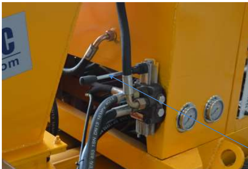
Hydraulic Valve of Agitator Forwarder and Reverse

地址 ADD: 郑州市金水区丰庆路 4 号院 14 号楼 9 号 邮编 P.C.:450053 No.9, Building 14, Yard No.4, Fengqing Road, Jinshui District, Zhengzhou, Henan China 网站 Web: www.gaodetec.com 邮箱 E-Mail: info@gaodetec.com 电话 TEL.:+86-371-55951210 传真 FAX:+86-371-55951210