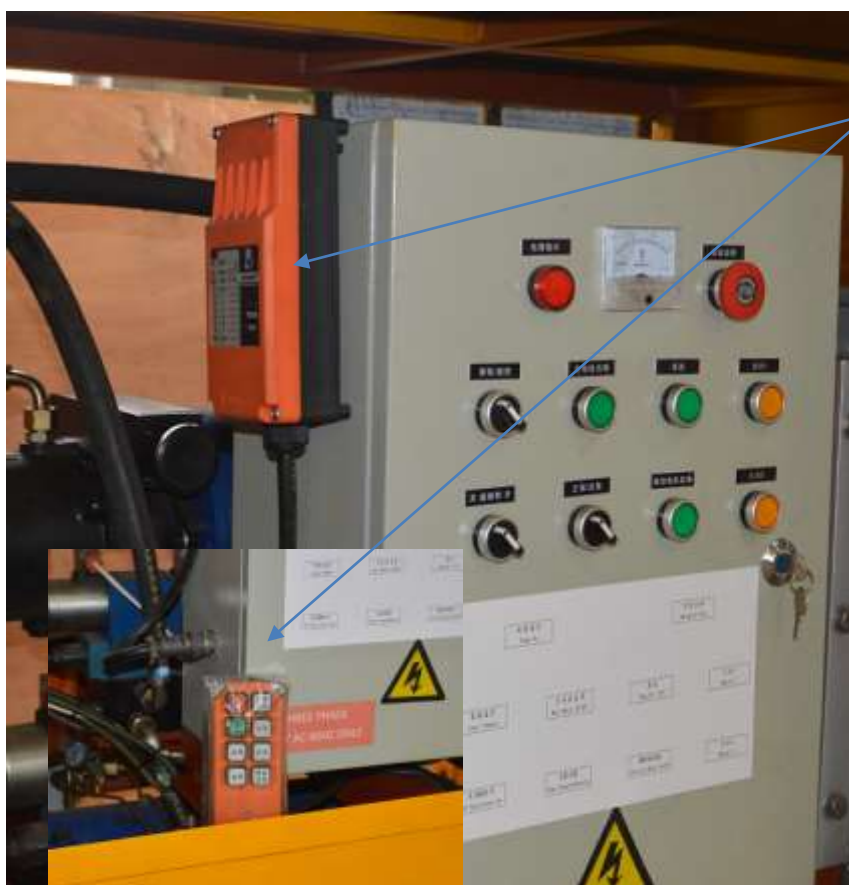
wireless remote control