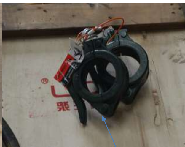
High pressure clamp