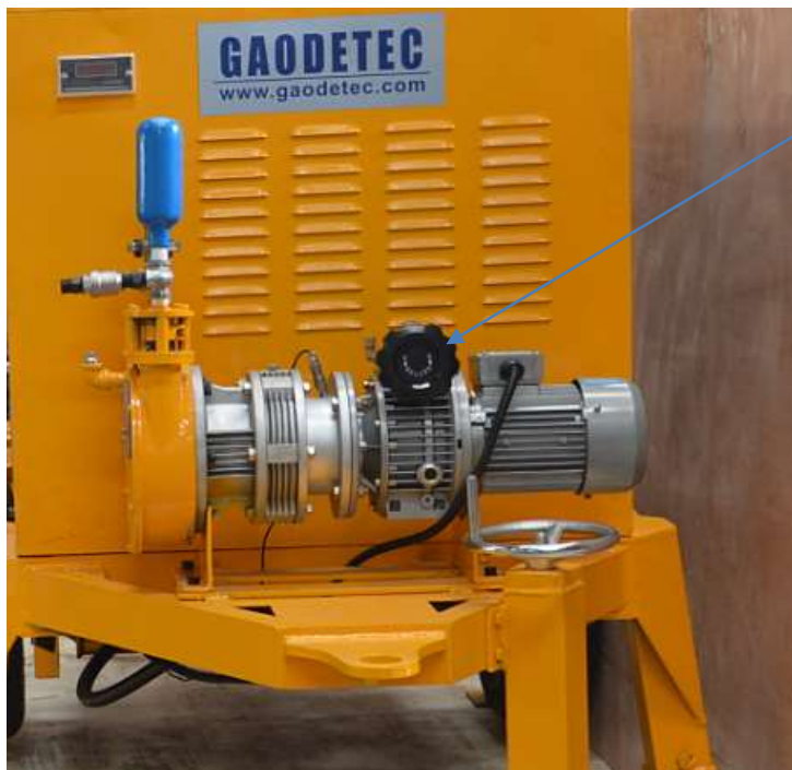
Additive pump stepless speed handle

地址 ADD: 郑州市金水区丰庆路 4 号院 14 号楼 9 号 邮编 P.C.:450053 No.9, Building 14, Yard No.4, Fengqing Road, Jinshui District, Zhengzhou, Henan China 网站 Web: www.gaodetec.com 邮箱 E-Mail: info@gaodetec.com 电话 TEL.:+86-371-55951210 传真 FAX:+86-371-55951210