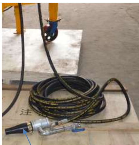
Shotcrete spray nozzle