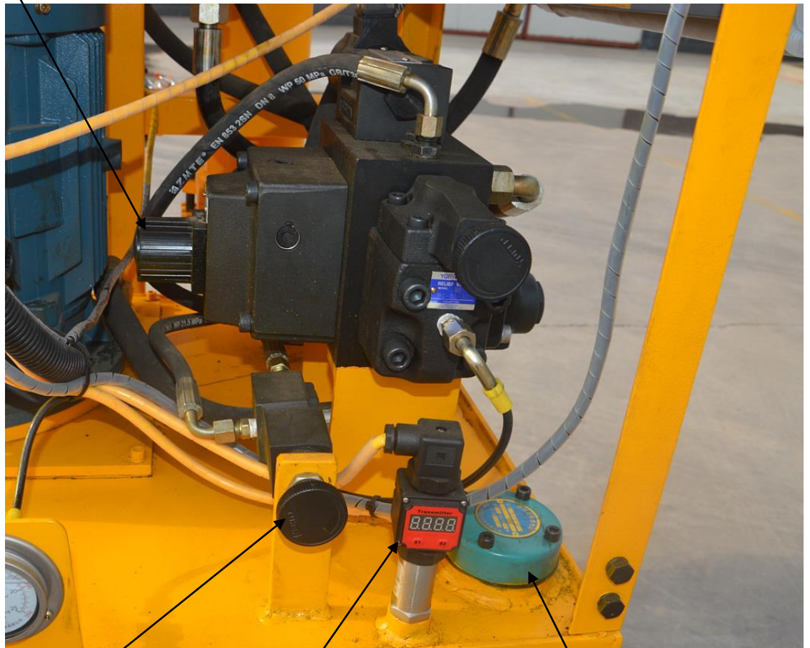
Variable Pressure Valve