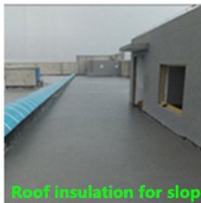
Roof insulation for slope