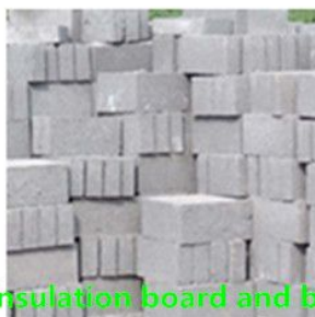
Insulation board and block