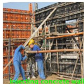
Injecting concrete wall