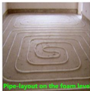
Pipe-layout on the foam level