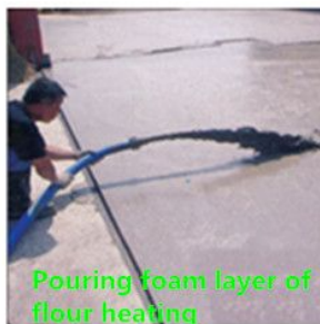
Pouring foam layer of floor heating