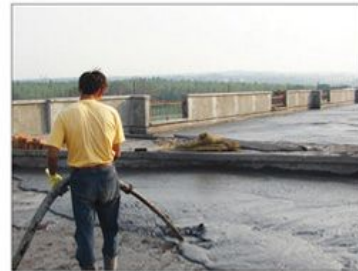
房顶保温隔热施工 roof insulation