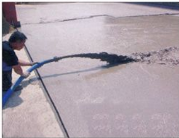
地暖发泡层的浇注 floor heating project