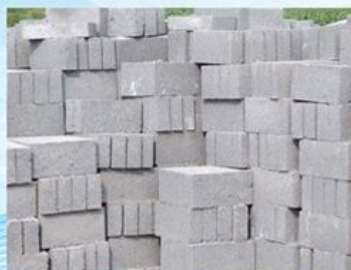
insulation board and block