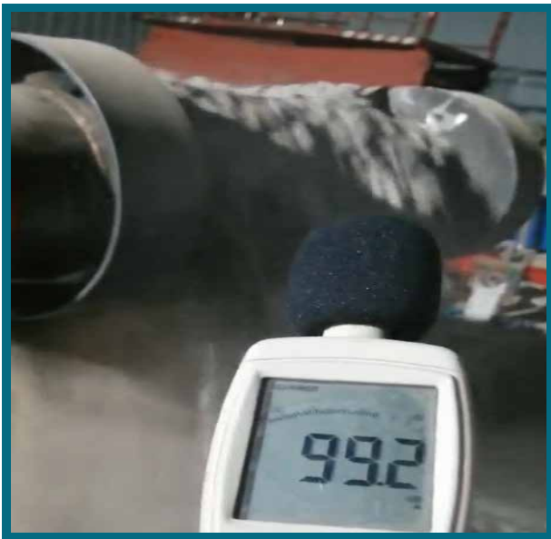
Low noise with full loading