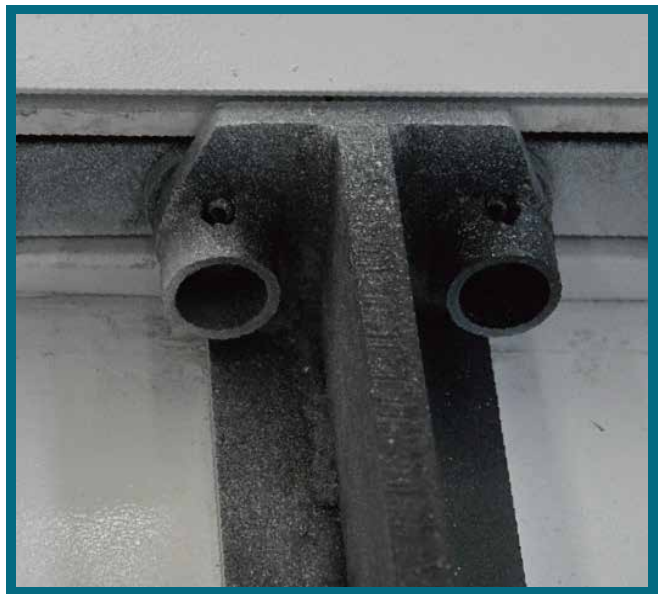
To protect the pins of the chain